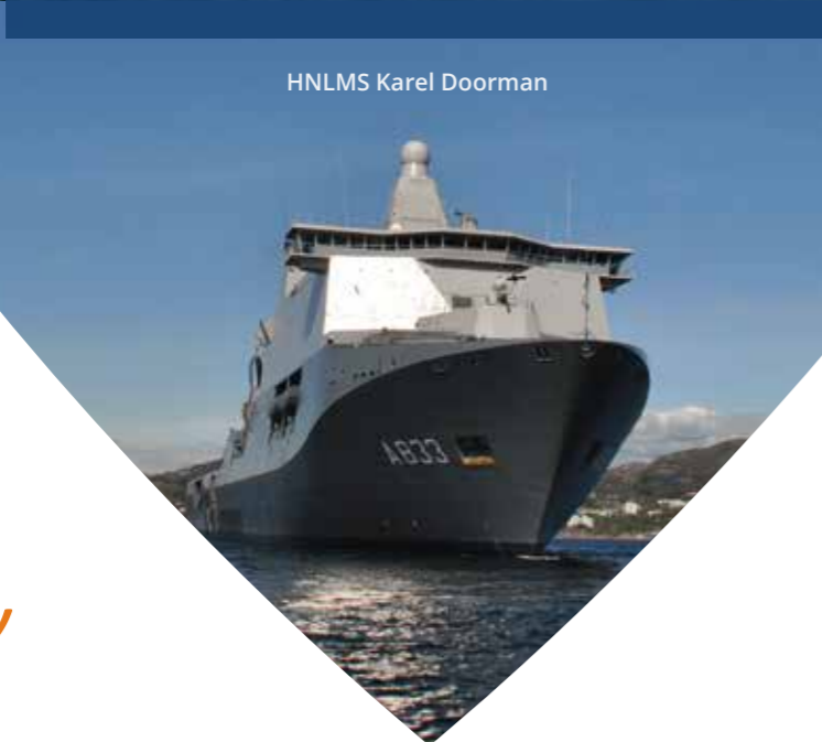
HNLMS Karel Doorman

Learn more on www.theipcompany.nl or get in contact via +31 (0)85 1119 111